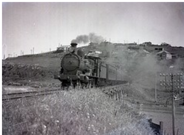
Train hauled by 3294 over the wooden bridge over Spring Ck BOMBO as it comes out of the Kiama tunnel heading north. Note the few houses and no Hart's Service Station yet.

South Coast Daylight train started service in 1933. It was pulled by two 32 class locomotives painted green (3306 and 3374) which had special green and cream CUB carriages. By 1949, South Coast Daylight ran a 7 car air conditioned HUB carriage set pulled by 38 class Pacific locomotives (4-6-2) as these carriages were heavier to pull on the Illawarra grades. Two 32 pulled it from Thirroul to Bomaderry. The Kiama line was too light for 38 class locos. In 1957 the SCD train was pulled by 36 class (4-6-0) 3616 towing FS and BS carriages (non air cond). Steam haulage of SCD stopped with the last run pulled by 3801 to Thirroul and onward to Bomaderry with 32 class power. It was replaced by DEB set (self propelled diesels) and in May 1961 this train was run with BUDD cars. These American Budd cars were very unreliable, had fire problems in their engines resulting in this train being pulled by 45 or 48 class diesels. Deb sets were used for a few years again. The end of an era came in 1991 when the South Coast Daylight was stopped and the Budd cars were cut up for scrap (Stainless steel). The timetable for South Coast Daylight departed Sydney at 9:25 am Wollongong 11.06, Kiama 11.33 all stations to Bomaderry arriving at 12:42 pm. The train returned to Sydney departing Bomaderry at 2pm, Kiama 2.47 and arrived at Sydney at 5:18 pm.