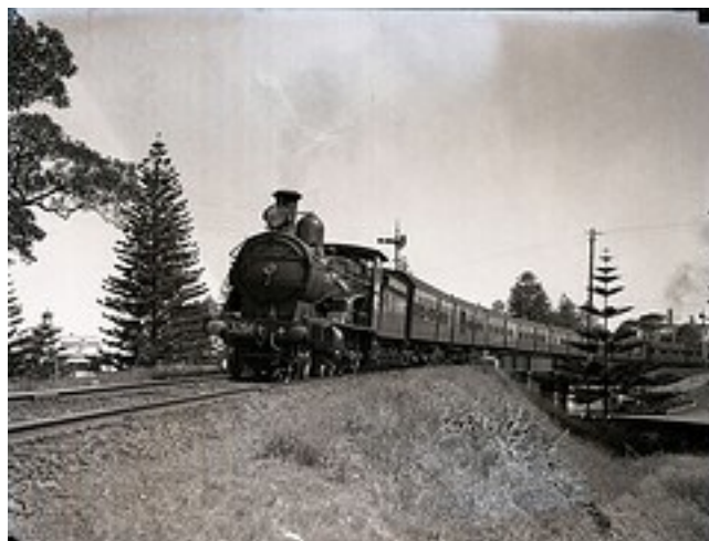
3266 coming over the iron bridge over Terralong St, Kiama

By 1986, Wollongong finally had an electric inter urban train service and commuters had a DEB 900 set to Kiama and beyond. Kiama had electric interurban trains in 2001.