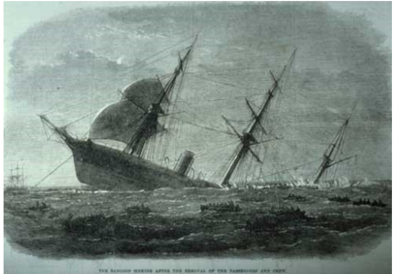
SS Rangoon sinking after removal of passengers and crew

Shipwrecks along our coast have mostly been attributed to small coastal traders serving coastal ports like Sydney, Newcastle, Wollongong, Broken Bay (Hawkesbury River), Port Stephens, Coffs Harbour, Ulladulla, Jervis Bay, Eden and vessels coming to grief on bars at the northern rivers like Manning, Richmond, Clarence and Tweed Rivers. Obviously, entering ports at night was more dangerous and vessels relying on sail power were less manageable in port navigation. Adverse weather is a main factor in shipwrecks. Some 2/3 of NSW shipwrecks have occurred in the colder months as winter and early spring have the greatest numbers of SW gales. Many wrecks are also attributed to elongated peninsulas like Bass Point or offshore islands such as Five Islands, Montague Is. etc. Some wrecks were reasonably blamed on poor navigation or drunken captains.