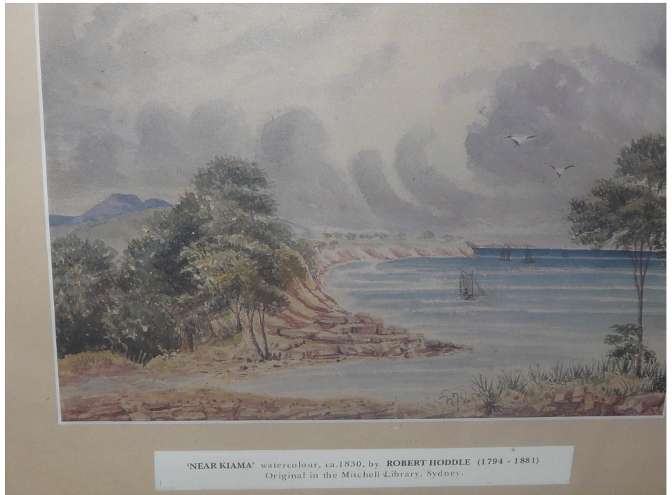
Doesn't look dangerous

A safer harbour was needed at Kiama because numerous wrecks occurred during bad weather and local businessmen pressed for it to increase their trade with Sydney. The construction of a barrage (sea wall) commenced in 1871) and the rock