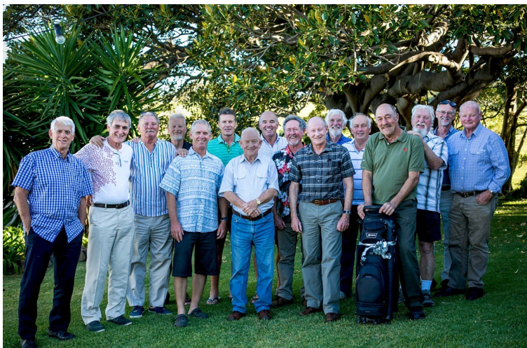
Lions, SOFGOKS and a random assortment of beauty pageant rejects