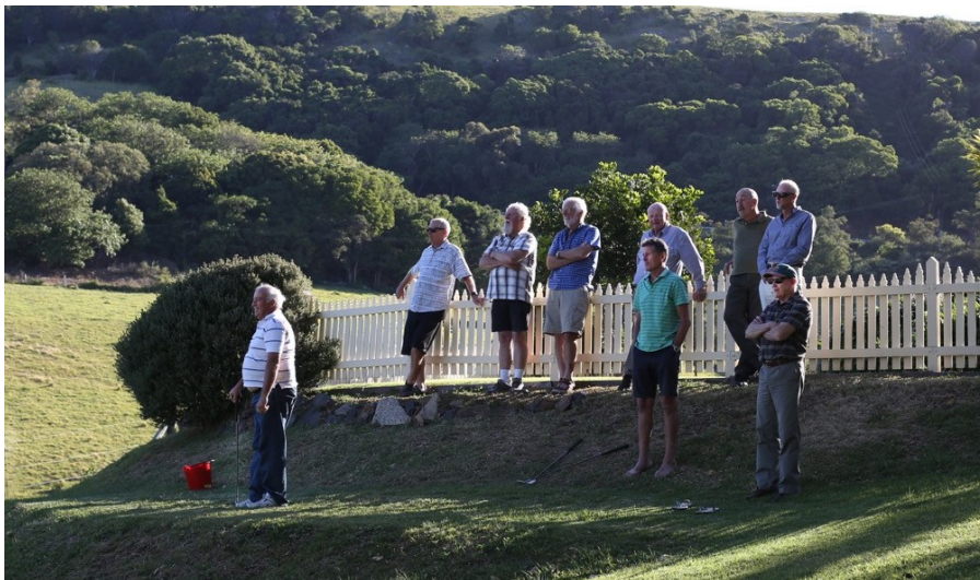
One worker, eight watchers—sound familiar?